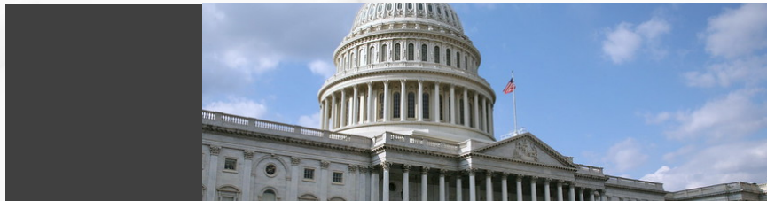
Between State Agencies and Federal Government