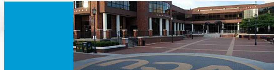
Between State Agencies and Universities