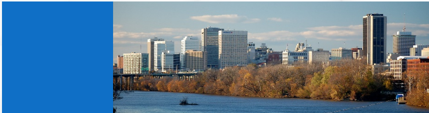
Between Virginia State Agencies